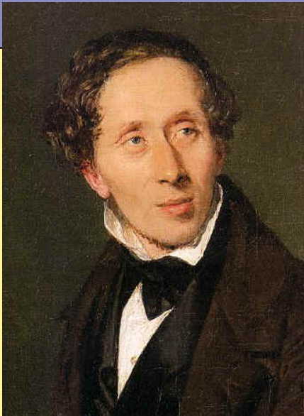
Hans Christian Andersen (1805-1875) Danish author of fairy tales, novels and plays

A Little Fish Out of Water: Hans Christian Andersen's "Little Mermaid" (1837) and Zinaida Gippius's "Sacred Blood" (1901)